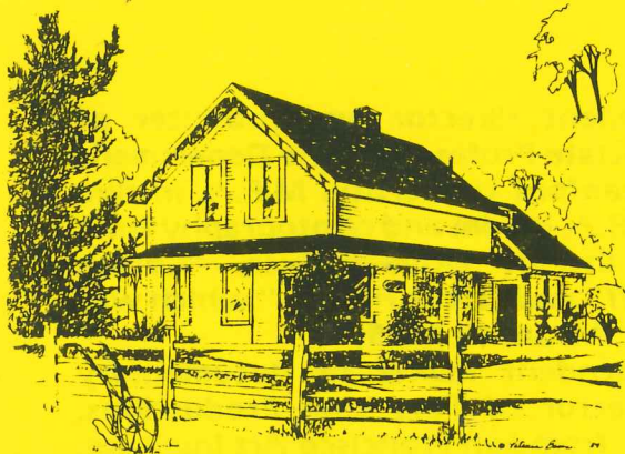
The Plough and the Stars Country Inn